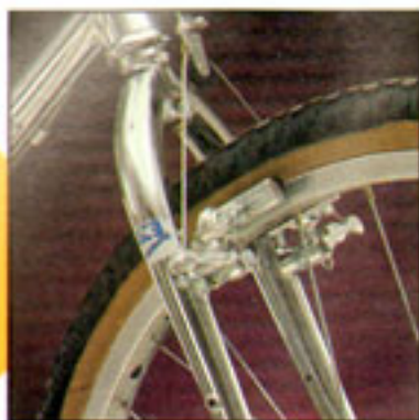
4130 chromoly unicrown design fork with 1 1/2" tubing reduces weight while increasing steering response and trackability.

Consider the Mongoose® ATB™'s precision, wide range 15-speed gearing, with its incredible 1:1 low gear; patented lightweight alloy Pro Class™ Wheels, a Mongoose® exclusive; or the unique skinwall tires which provide "fat tire" comfort with efficiency of a "highway" center rib to reduce pedaling effort to a minimum. The ATB™ has even been equipped for touring with front and rear mounts for racks and fenders and braze-on bosses for two water bottles (single bottle for Ladies model).