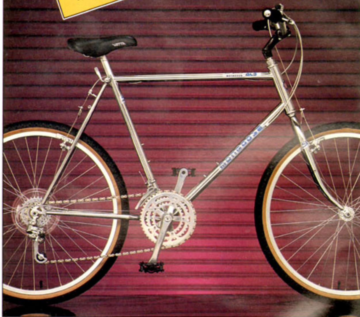
Complete CPSC Equipment Included, but not Shown.