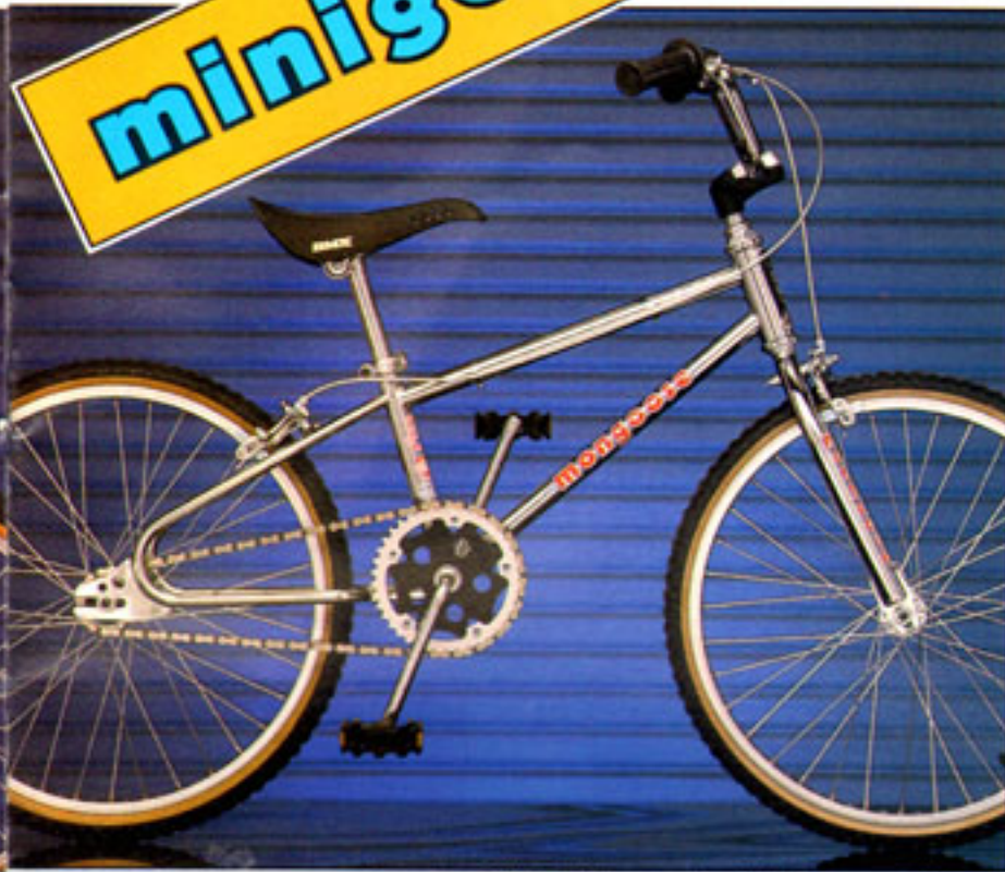
Complete CPSC Equipment Included, but not Shown.