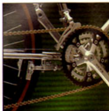
Suntour CB6100 roller cam brakes are positioned on the chainstay for greater braking efficiency.

The ATB Pro TM is available in 19" and 21 1/2" frame sizes. Finished in durable, scratch resistant, low maintenance chrome.