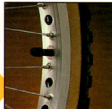
Pro Class™ Alloy wheels reduce critical 'rolling stock' for dramatic increases in acceleration performance.

The Expert™ is available in bright chrome plate with Black accessories or in Brilliant Blue or Steel Gray with matching accessories.