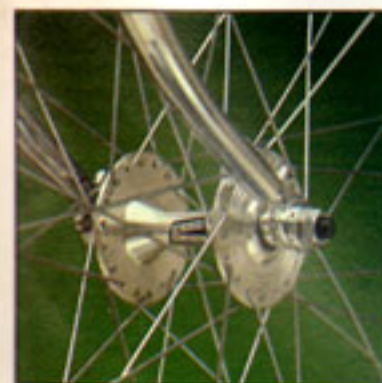
Sealed bearing hubs resist mud and dirt while the track axle nuts ensure maximum torque.