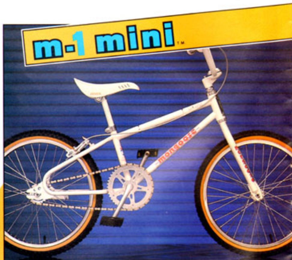
Complete CPSC Equipment Included, but not Shown.

Available in chrome with black accessories.