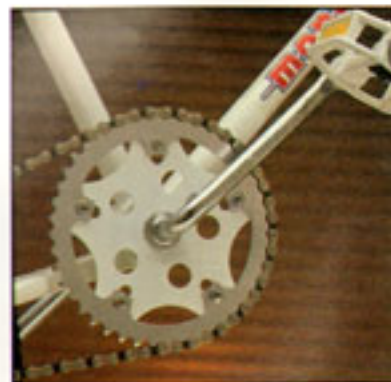
SR Cosmolite Boron Steel Cranks and quick change Power Plate™ are featured on standard Californian™ model.

Either way, the Mongoose® Californian™ will provide you with engineering, styling and performance in the finest tradition of bicycle motocross.