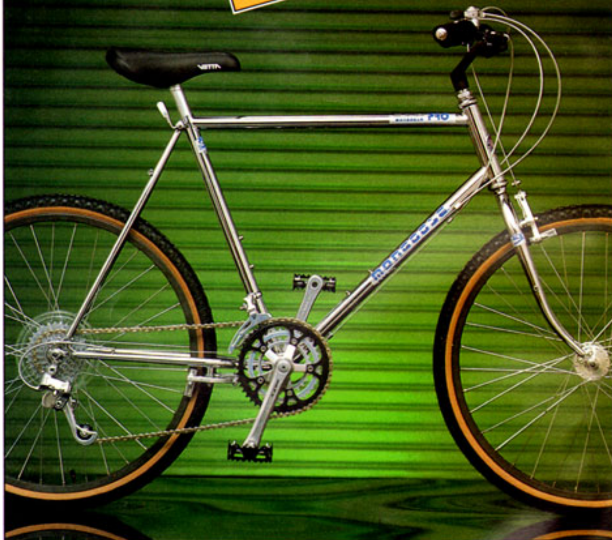
Complete CPSC Equipment Included, but not Shown.