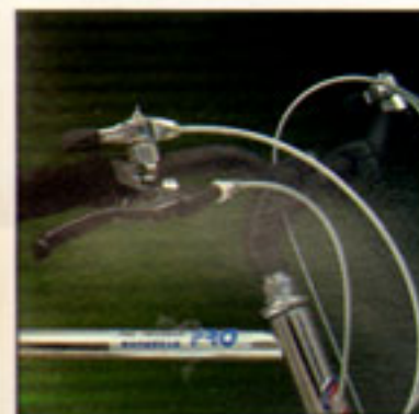
Ergonomic brake levers and Suntour fingertips provide effortless shifting and sure braking.