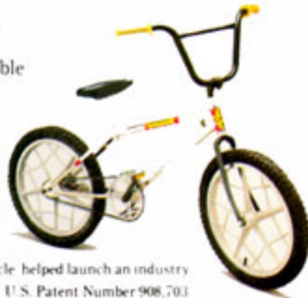
The original Mongoose® Motomag® Bicycle helped launch an industry U.S. Patent Number 908,703

The Motomag® Wheel, the company's first product, initiated a revolution in the sport of bicycle motocross by providing a virtually unbreakable wheel, the ultimate wheel advantage. The extra strong, one piece design became the first production cast aluminum bicycle wheel. It proved to be one of the starting points for a whole series of bicycle and component advancements in the bicycle industry.