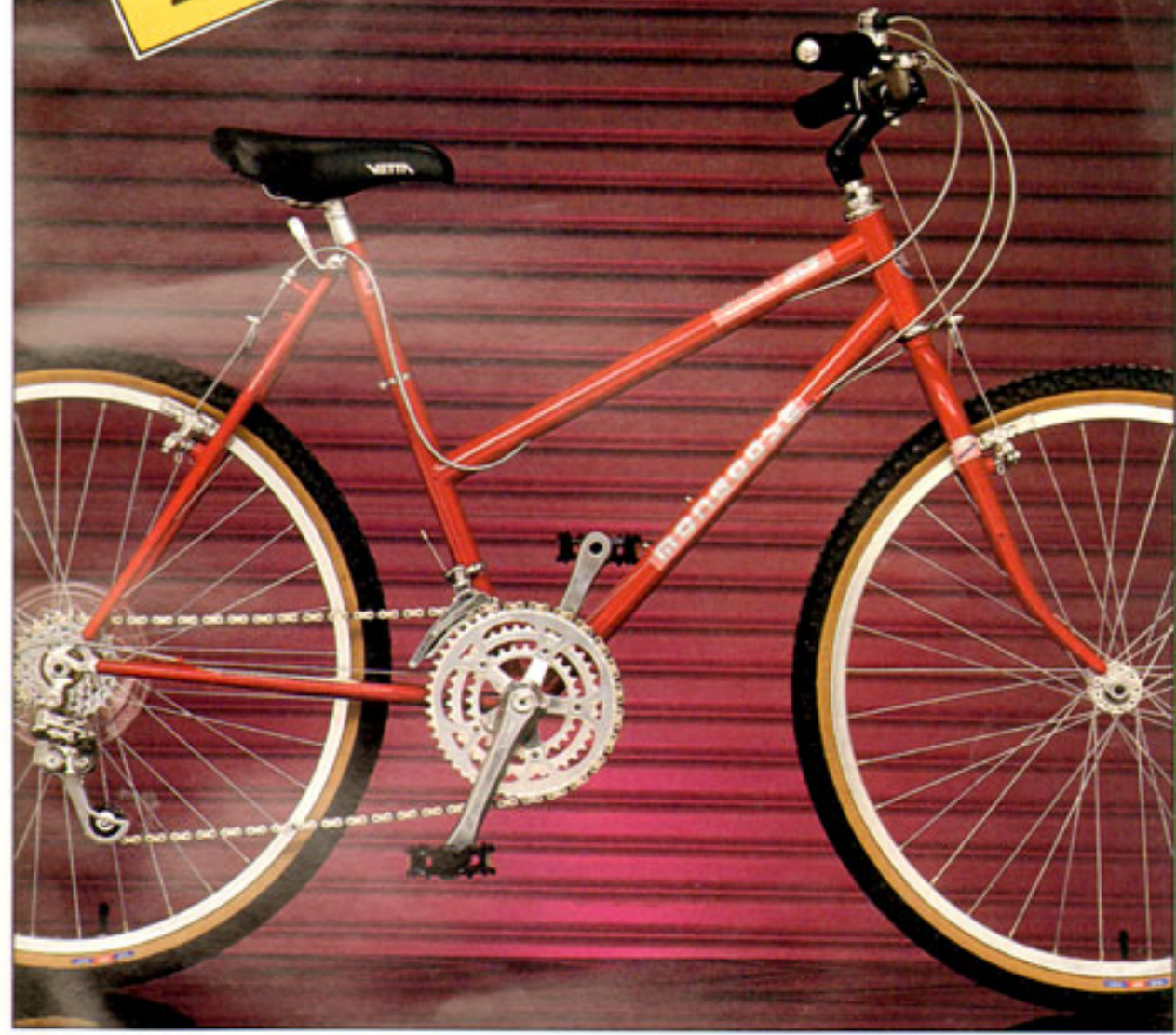
Complete CPSC Equipment Included, but not Shown.

The nation's leading cycling magazine, "Bicycling", summed it up perfectly, "The Mongoose® All-Terrain, with its aggressive frame geometry and well matched components, is a sure and fast off-road handler..."