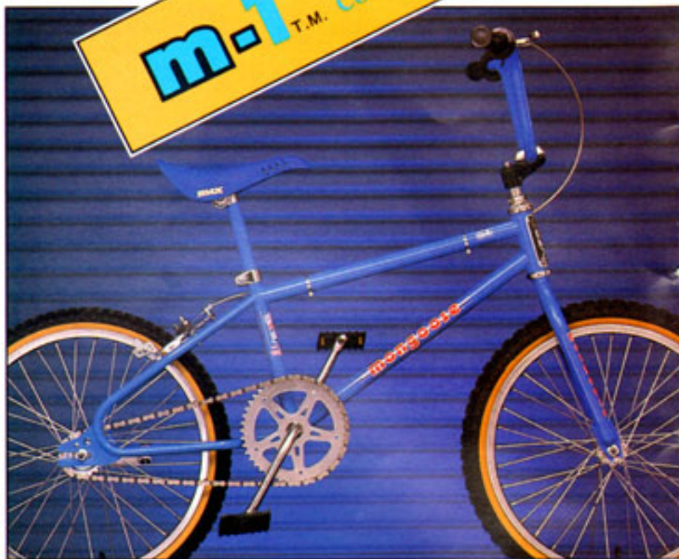
Complete CPSC Equipment Included, but not Shown.

The M-1™ Coaster is available in Brilliant Blue with matching trim or in White or Chrome with Black trim. The Freewheel is available in Chrome with Black trim and the M-1™ Mini comes in White with Black trim.